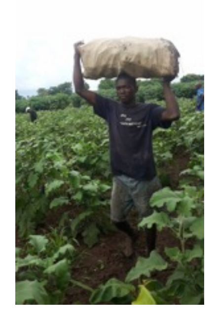
Eggplants just harvested on Farms 3 & 4, two months after transplant